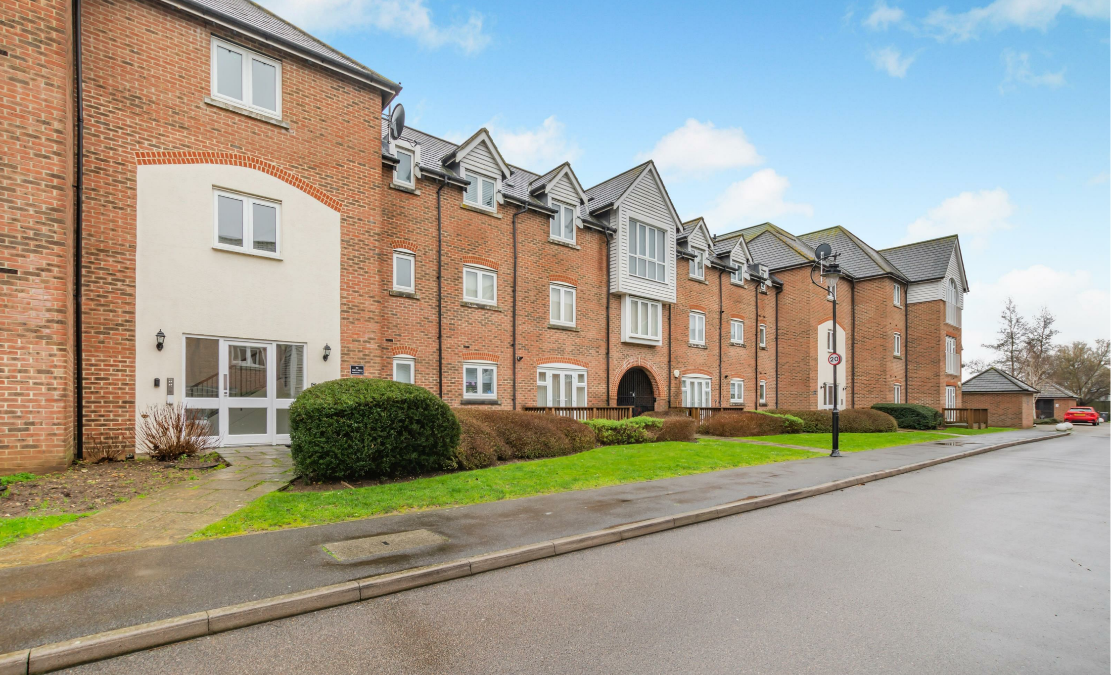
The Lakes, Larkfield, ME20 6GQ £285,000